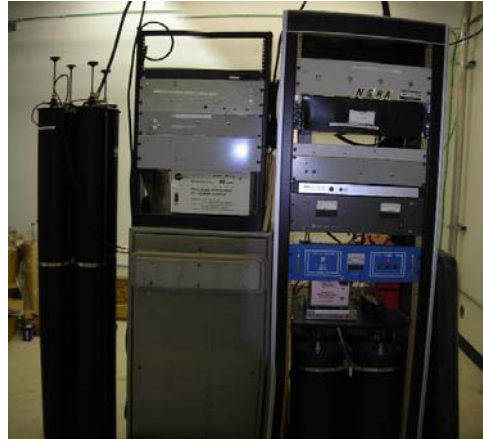
Front of machines installed