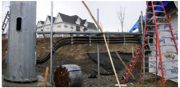
Cables going to tower