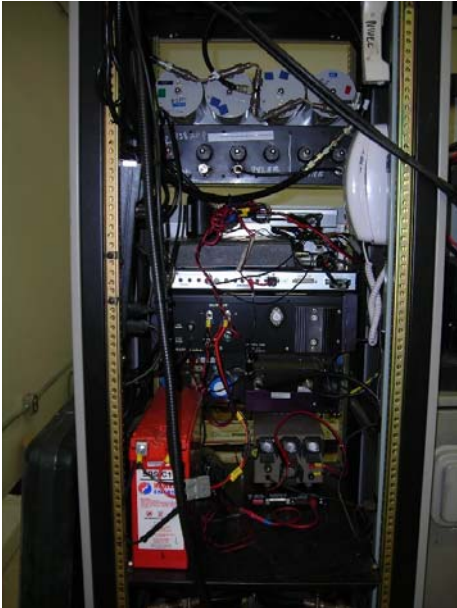
Rear of 2 meter machine