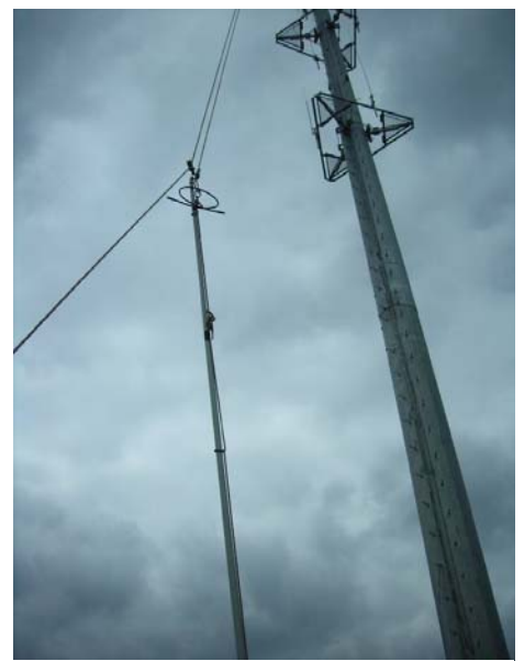
Tower going up