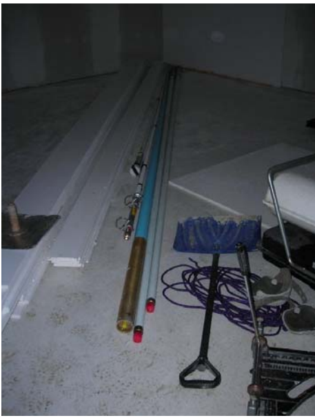
Antenna awaiting it's move