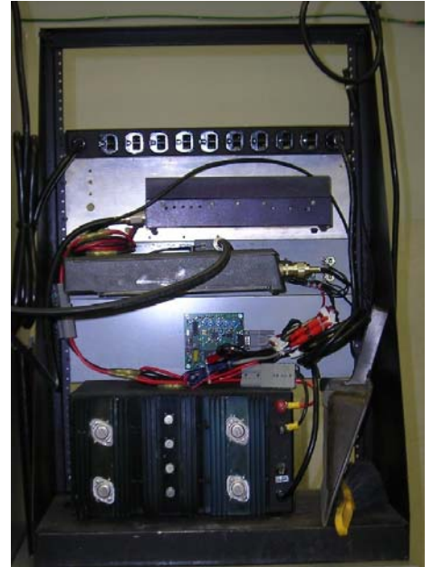
Rear of 440 machine