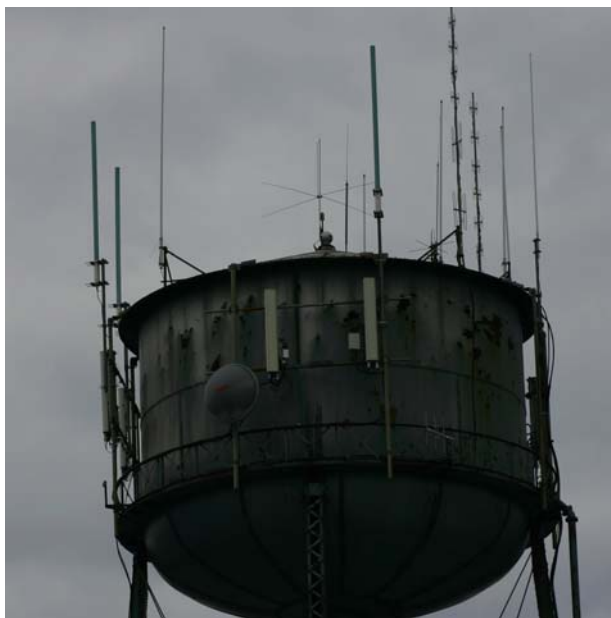
Water Tower with multiple antennas