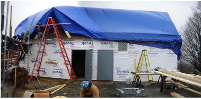
New building, our equipment will be on the right